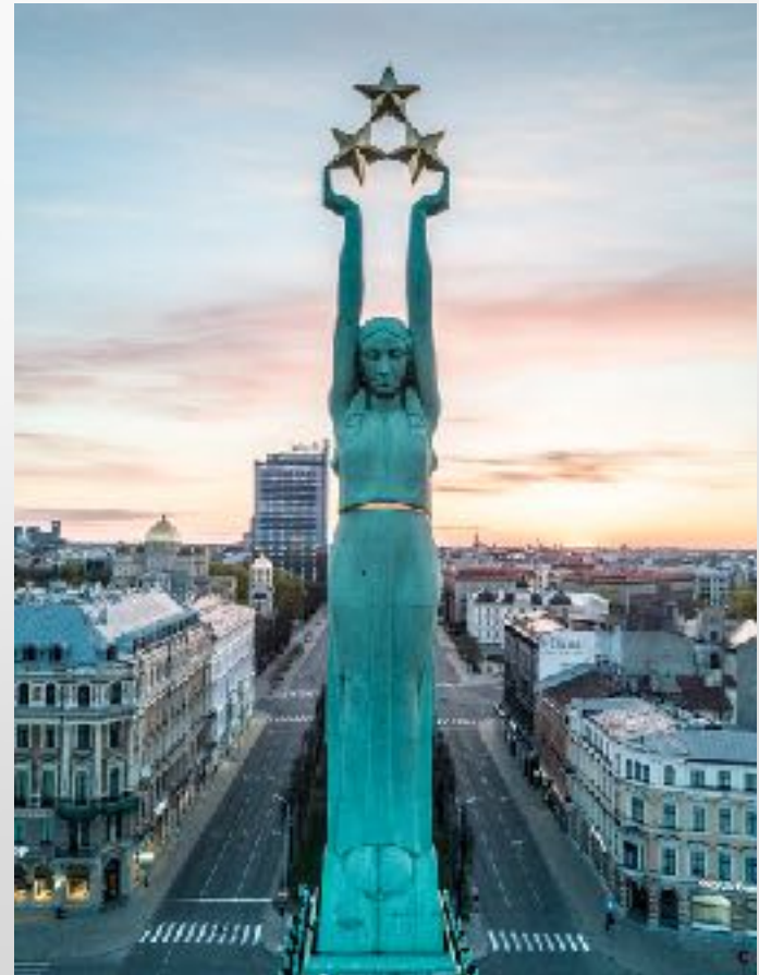
The Freedom Monument