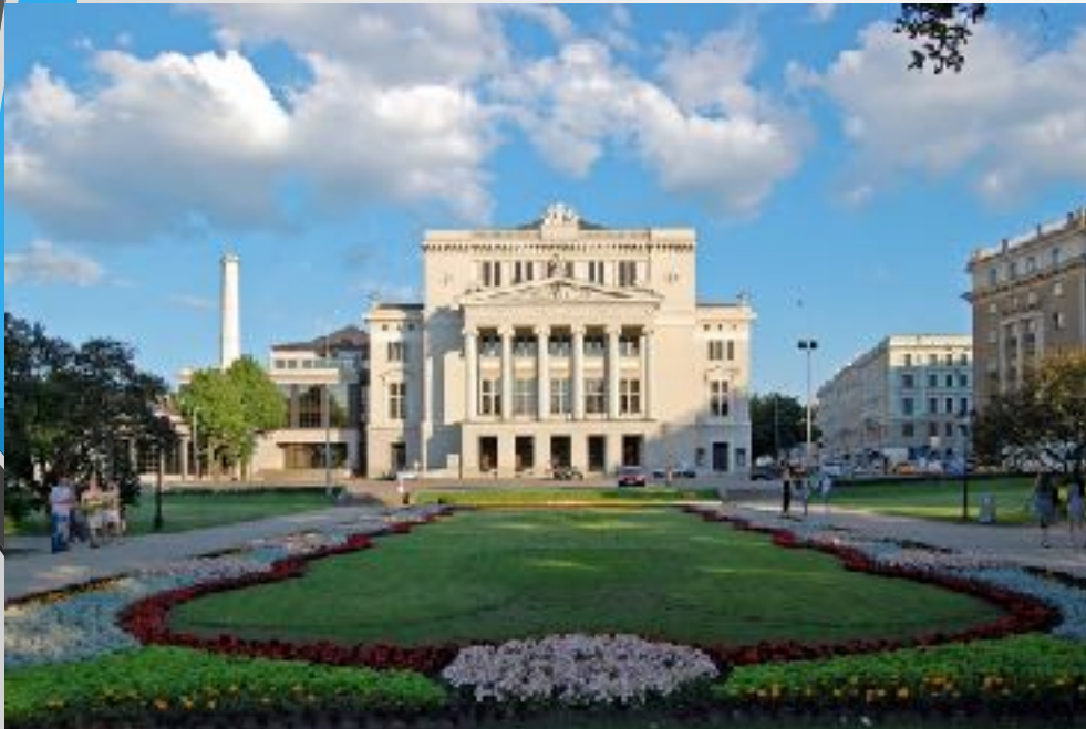
Latvian National Opera