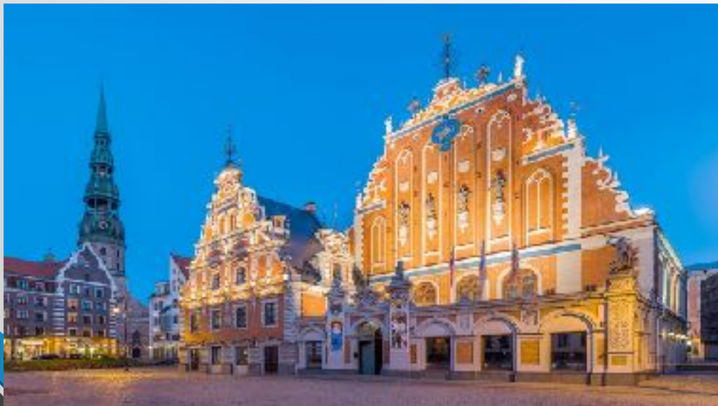
House of Blackheads